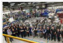
Packaging Automation Shortlisted For 2017 E3 Business Awards