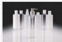
Popular Sized 300ml PET Tubular Helps To Complete A Family