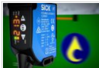
Slick New SICK Sensors